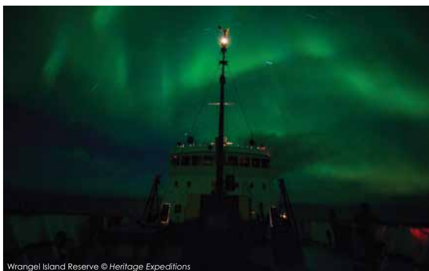
Wrangel Island Reserve

This expedition is subject to approval from various Russian Federal and Regional Authorities and may have to change depending on these approvals. Permits have been lodged for all the sites mentioned in the itinerary, depending on approvals these may have to be amended or substituted. We will endeavour to keep participants fully informed of any changes in the itinerary as and when they occur.