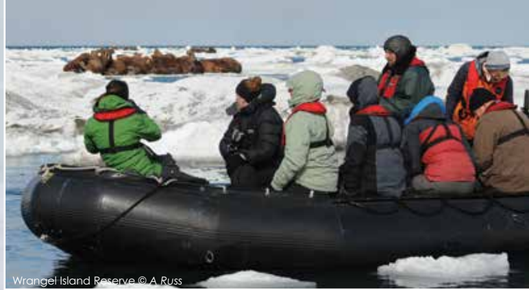
Wrangel Island Reserve