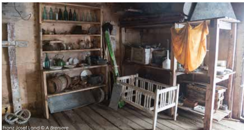
Franz Josef Land

to spot Beluga Whales and Bowhead Whale and if we are extremely fortunate we may find the extraordinary Narwhal with its unicorn-like single tusk.