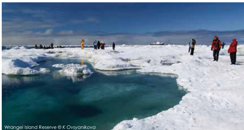
Wrangel Island Reserve

including Brunnich's Guillemot, Crested and Parakeet Auklets plus Tufted and Horned Puffins.