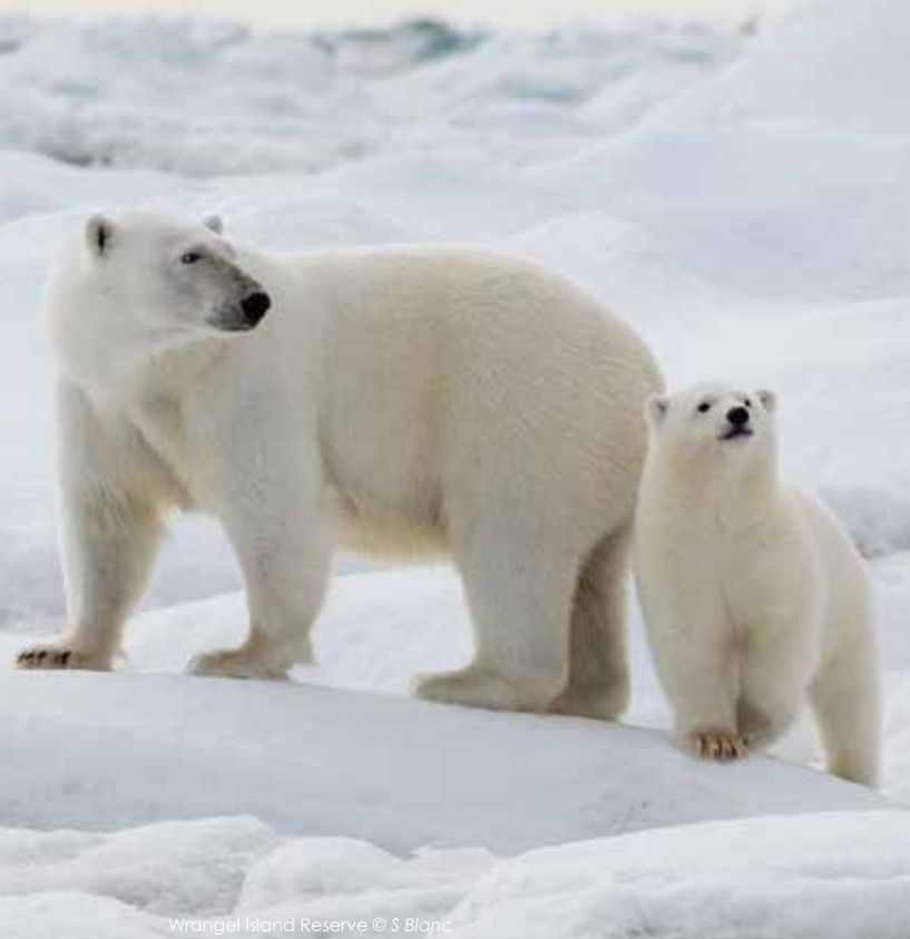
Wrangel Island Reserve