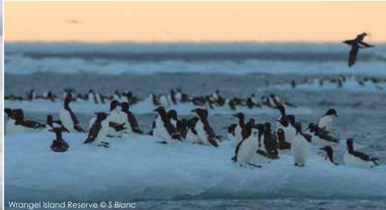
Wrangel Island Reserve © S Blanc